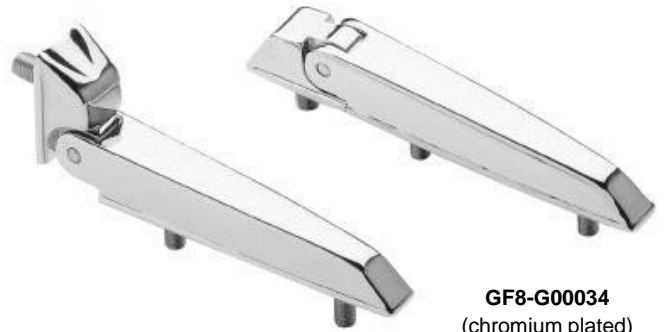
GF8-G00034 (chromium plated)